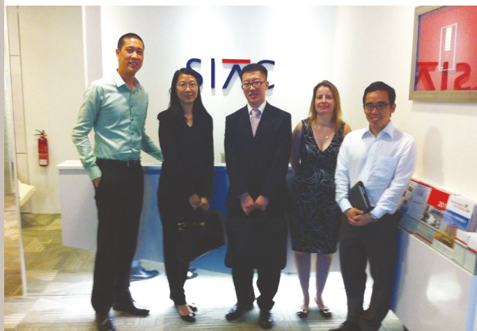
Counsel of the Department visit the Singapore International Arbitration Centre