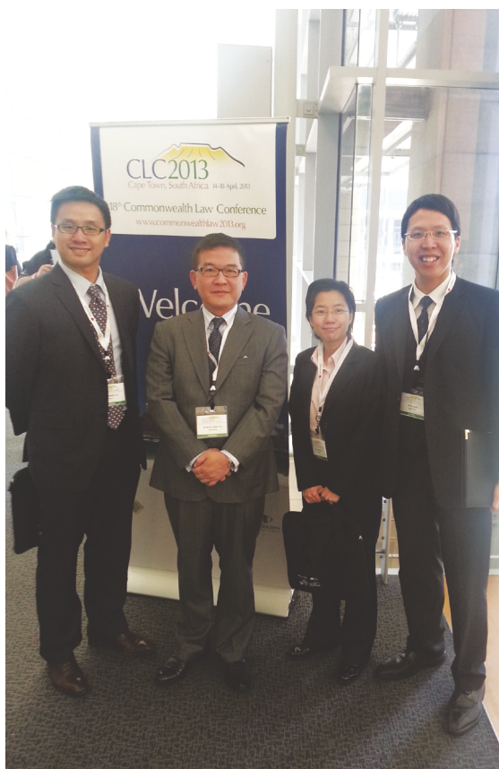
Counsel of the Department attend the 18th Commonwealth Law Conference in Cape Town, South Africa

particular. Attachment programmes were therefore tailored for the State Counsel with focus on exposure to these areas of law.