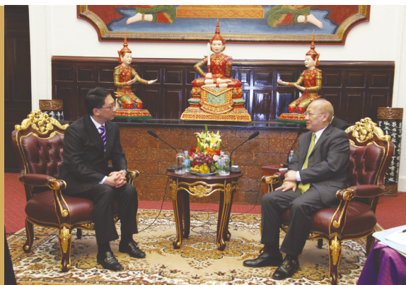
The Secretary for Justice (left) meets with the Minister of Justice, Mr Ang Vong Vathana, in Phnom Penh, Cambodia, in February 2014