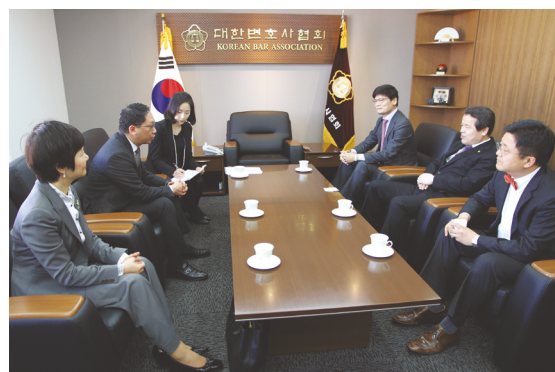
The Secretary for Justice (second left) meeting with the Korea Bar Association during an official visit in Seoul in November 2013

Bar Council of England and Wales. Visitors from the Mainland included senior judges from the Supreme People's Court and senior officials from the Supreme People's Procuratorate, the National Development and Reform Commission, the Ministry of Justice, the Department of Treaty and Law of the Ministry of Foreign Affairs, and Departments of Justice at the provincial and municipal levels. Other members of the Department met a wide range of visitors to the Department from 2012 to 2014. Members of