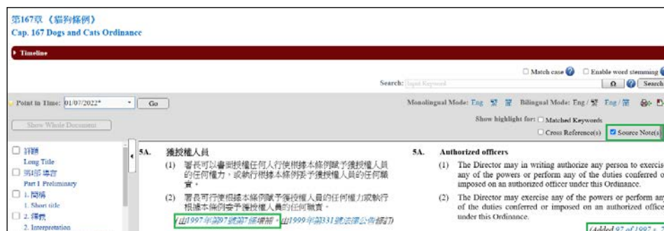
(Embedded hyperlinks in source notes)

21. Embedded hyperlinks have also been set up to those electronic copies in the source note of the related legislative provisions and under “Enactment History” of the “Other” tab of the “View Legislation” page of the related legislation, for ease of cross-referencing (see illustration below).