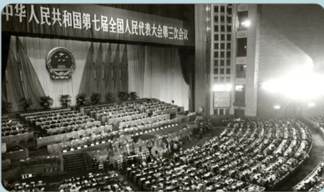
The Third Session of the Seventh National People's Congress

The Basic Law was adopted by the NPC on 4 April 1990. So far as the legal system was concerned, the underlying philosophy of the Basic Law was one of continuity. Hong Kong's legal system was an offshoot of England's common law system, which is based on the English language. China has a fundamentally different system, which is based on the Chinese language. No one doubted, therefore, that it would be a real challenge to turn the principle of continuity into a reality.