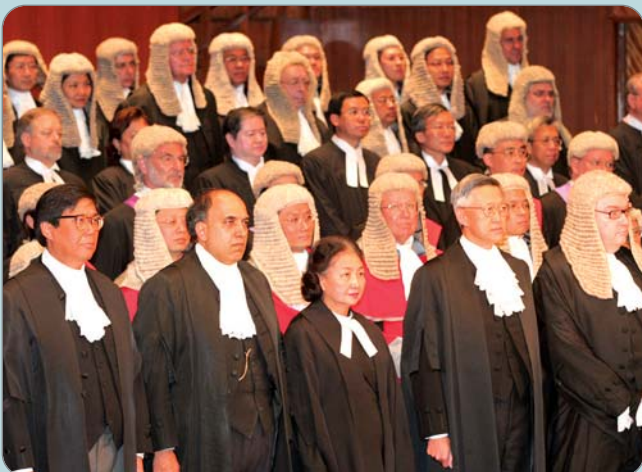
Ceremonial Opening of Legal Year 2005

That exercise has not been as easy as it might seem. Replacing ‘the Governor’ by ‘the Chief Executive’ may be simple. But there are not always such convenient substitutions. References to ‘the Crown’ have proved particularly difficult, since it is a concept peculiar to the British constitution. Nevertheless, a steady stream of adaptation Bills were prepared and passed by the Legislative Council. The process is not yet complete – but about 93% of the Ordinances have been adapted.