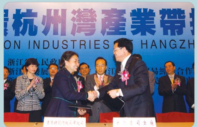
Signing of a Legal Services Co-operation Agreement between the Department of Justice and Zhejiang Justice Bureau

As the Mainland's economy continues to expand dramatically, there is a great demand for sophisticated legal services there. Many Hong Kong lawyers are taking up that challenge and, in so doing, can contribute to the development of legal services in the Mainland.